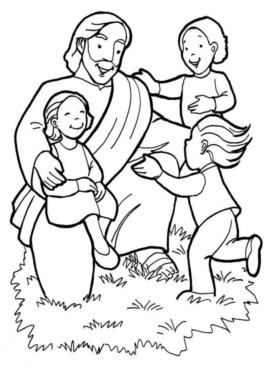
Little ones to Him belong,