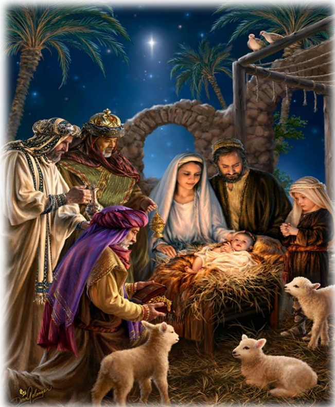
Artwork © Dona Gelsinger